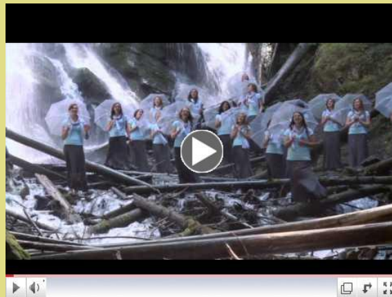
Showers of Blessing Fountainview Academy