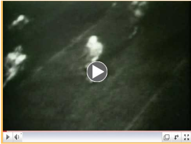
One-Legged Wonder Makes Hall of Fame